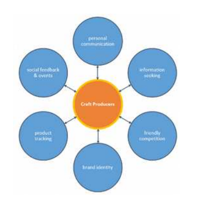
Figure 5. Craft producers GT analysis key themes

Importance was placed on who responds to consumers via social media, with a dedicated 'social media person' viewed as undesirable in-lieu of a someone who is directly responsible for producing the beer, P2: "I don't think that works really, it's a very easy way to crush people's ideas of what they want out of your brand isn't it. If you tweet something that they don't agree with, then they're going to **** you off straight away."