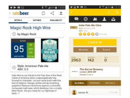
Figure 1. Scalable community-driven craft beer applications