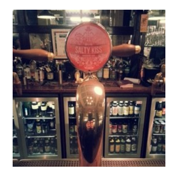
Figure 6. Brewery pump-clip artwork

perceive their brand, for example through their use of social media and beer artwork, particularly on pump clips for serving beer (see Figure 6).