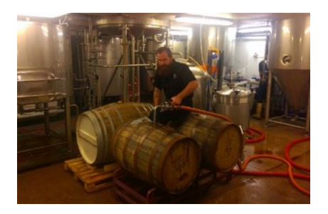
Figure 2. 'Brew day' - full cycle of beer production

Analysis was carried out using a Grounded Theory (GT) approach [42], to label and categorise the emergent themes from the data.