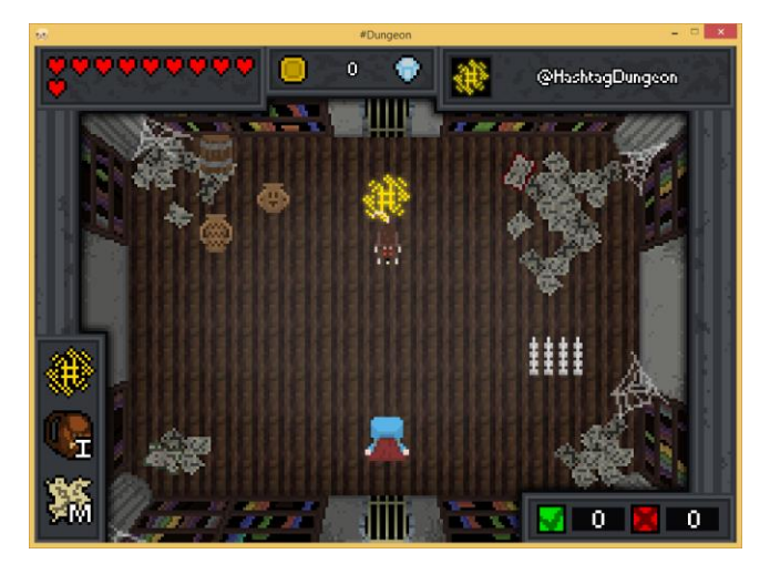
Figure 1. Gameplay view of Hashtag Dungeon.