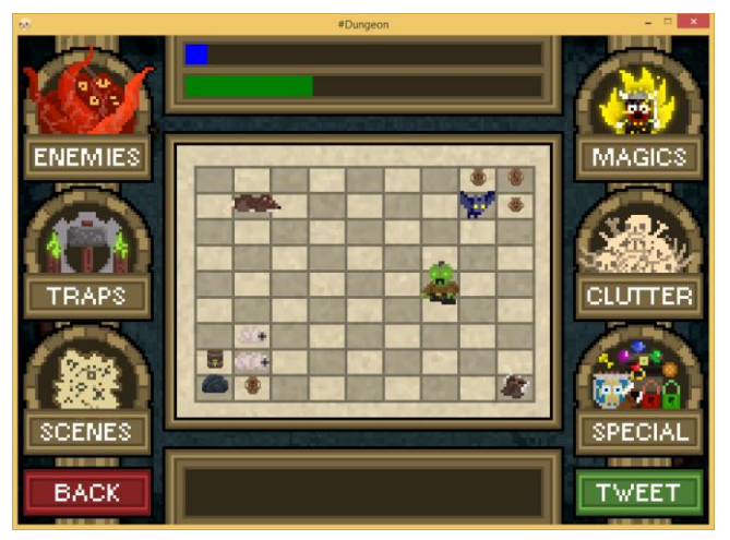
Figure 2. Editor view of Hashtag Dungeon .

Hashtag Dungeon is, on first glance, a relatively straightforward game where the player must overcome the challenges and perils that lurk inside a dungeon. The player sees the dungeons from a top down perspective and is able to move the avatar in eight directions and can attack by firing projectiles in four directions reminiscent of a twin stick shooter. Each dungeon is comprised of a series of linked rooms, each room may contain enemies for the player to slay, puzzles to solve and traps to avoid. The player takes control of an avatar tasked with clearing all the rooms in a dungeon and then defeating the dungeons boss. When the player enters a room the doors lock preventing them from leaving until that room is clear of enemies, enemies attack the player by either shooting projectiles that the player can move to avoid or by physically attacking the avatar. Enemies can be killed by the player but they have varying health and attack patterns for the player to master, this on top of traps such as spikes that must be avoided and puzzles leads to varied dungeons with a player not knowing what to expect before entering each room. The unique feature of Hashtag Dungeon is that the actual dungeons are generated collaboratively by the player community (Figure 1). The game was originally deployed with an initial set of two dungeons available to players to introduce the basic concepts of the game. The number of dungeons