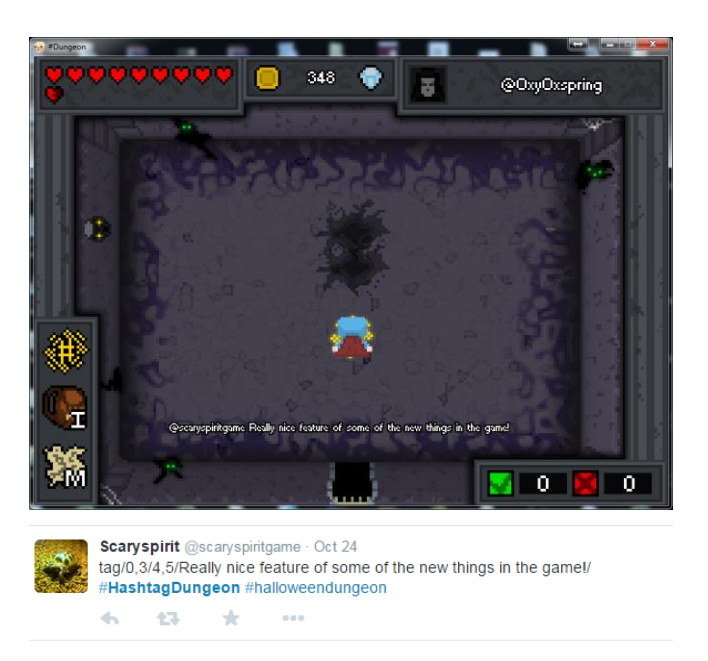
Figure 4. A player left message as seen in game and on Twitter.

Players can attach any dungeon name to their room creation tweet. In this way, they can create a room and then decide which of the existing dungeons to attach it to. This allows multiple players to collaboratively construct a sprawling dungeon, through individually creating one room at a time. Also, because any player can attach a room to any of the existing dungeons, it means that no one player can own or