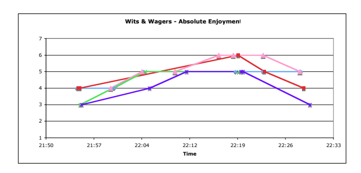
Figure 4 - Trial Results for Wits & Wagers using Prototype II

This behaviour can be seen clearly on the graph in figure 4. The group is playing a trivia game [3] that consists of seven rounds of questions to be answered by players simultaneously. Once all players have written an answer, they are revealed and players can place bets on which answer they think is nearest before the correct answer is revealed.