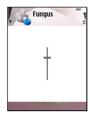
Figure 3 - Prototype IV

there were concerns about privacy of reports. When a user moves the slider, a feature of the phone keeps the screen lit up for several seconds after the interaction. In this time, it is possible for other players to briefly see the level of the slider on the phone screen and therefore see the current enjoyment state of the reporting player.