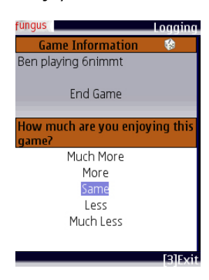
Figure 1 - Prototype I

Users reported feeling confused by the relative reporting. They generally had trouble keeping in mind their level of enjoyment between reports – in these cases they were unable to remember their previous state in order to be able to