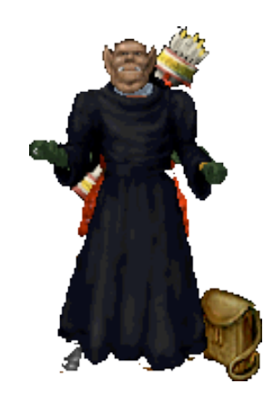
Figure 1 - Player dressed as an Orc in Ultima Online

Massively multiplayer games have long recognised the importance of letting players affect the game world in some way. Apart from character customisation (an important form of self expression by players) the most widespread feature is guild or clan systems that allow players to create formal organisations within the community. Games like Ultima Online [33] and Star Wars: Galaxies [32] offer more personalisation options through player owned property that appears in the common game environment.