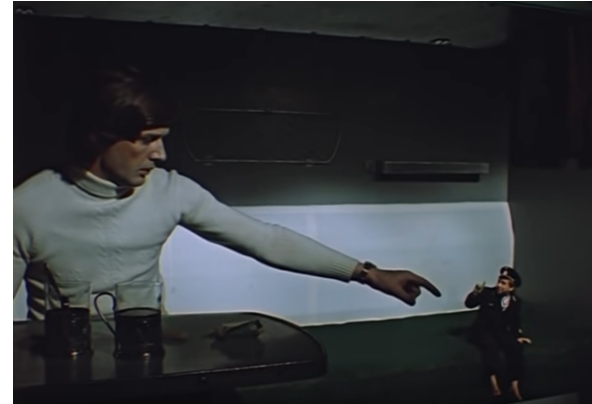
Figure 3: Still from Charodei [9], a 1982 TV adaptation. ©Odessa Film Studio

"Monday" is an interesting book because the main themes are around academia and academic working in the space of emerging technology. The book is a series of vignettes set in the (Soviet) National Institute for the Technology of Witchcraft and Thaumaturgy (NITWITT), a research organisation that deals with the investigation of the fantastical.