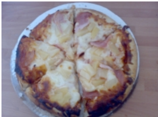
Figure 1. Examples of some images uploaded by participants.

We propose that a similar model of data analysis may be ideal for augmenting photographic food diaries. Specifically, users may tag uploaded food image content in the same way that players of The ESP Game and Peekaboom tag image content. This model is both novel within dietary interventions and is highly scalable, since additional users necessarily provide the system with additional processing power.