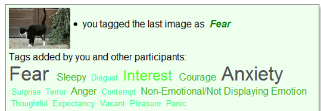
Figure 1. Example tag cloud providing multiple user feedback

On opening the Tagpuss website, a user is presented with a random selection of one of the 1631 images currently in the repository, and asked the question 'How is this cat feeling?'. If a tag is chosen for the image and submitted, the user is then presented with feedback in the form of a tag-cloud displaying other tags provided by users for the image with the most popular emotion tags displayed larger. This feature allows the user to compare their own perception of an image to that of others. Feedback is only shown after the user has made a tag submission with an example shown in figure 1. If a user felt that they could not tag that particular image, there was a simple 'skip image' button, which allowed them to advance to the following image without submitting a tag. Skipped images were flagged for later analysis. We also developed a short questionnaire that participants were asked to complete at the conclusion of the trial period.