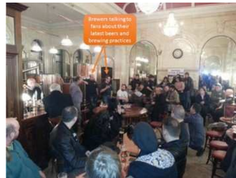
Figure 3. Meet the Brewer, brewers engaging with community

Outside of the brewery setting, one 'Bottle Sharing' and two 'Meet the Brewer' (MtB; see Figure 3) social events were attended with interviews and field notes recorded for analysis. MtB events bring together brewers and consumers of the craft beer community to participate in a discourse of craft brewing