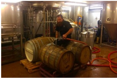
Figure 2. 'Brew day' - full cycle of beer production

Analysis was carried out using a Grounded Theory (GT) approach [42], to label and categorise the emergent themes from the data.