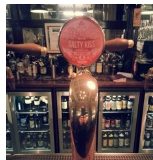
Figure 6. Brewery pump-clip artwork

perceive their brand, for example through their use of social media and beer artwork, particularly on pump clips for serving beer (see Figure 6).