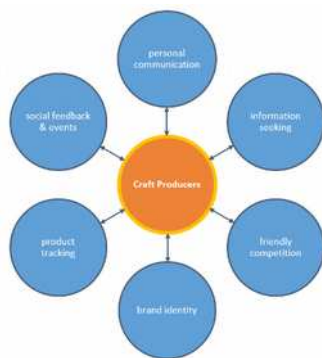
Figure 5. Craft producers GT analysis key themes

Importance was placed on who responds to consumers via social media, with a dedicated 'social media person' viewed as undesirable in-lieu of a someone who is directly responsible for producing the beer, P2: "I don't think that works really, it's a very easy way to crush people's ideas of what they want out of your brand isn't it. If you tweet something that they don't agree with, then they're going to **** you off straight away."